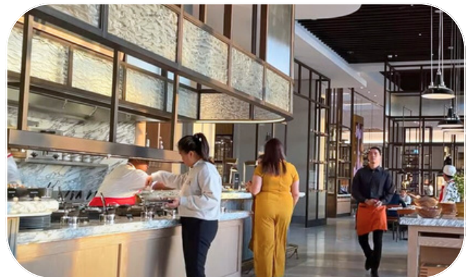
Royal Atlantis kitchen with Intelli-Hood optic sensors.

The installation of Intelli-Hood's DCKV controls at the Royal Atlantis Resort in Dubai serves as a benchmark for integrating cutting-edge technology to enhance kitchen operations. The project's success lies in the seamless installation process, minimal disruptions, and the tangible benefits realized in terms of cost savings, environmental impact, and operational efficiency. The Royal Atlantis Resort's commitment to sustainability and innovation positions them as industry leaders in the hospitality sector.