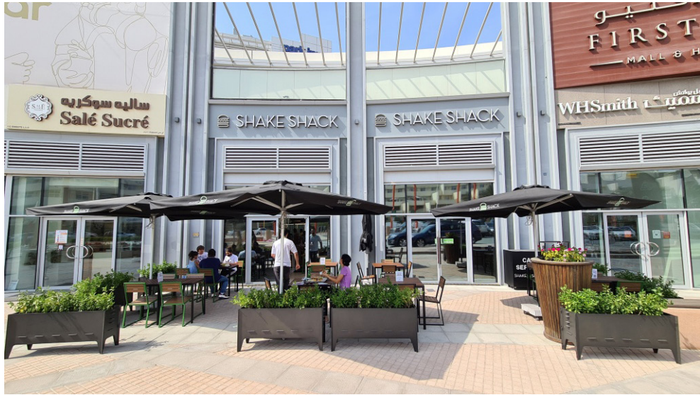
Intelli-Hood® demand control kitchen ventilation is installed in the kitchen hood at Shake Shack in the First Avenue Mall, Motor City.